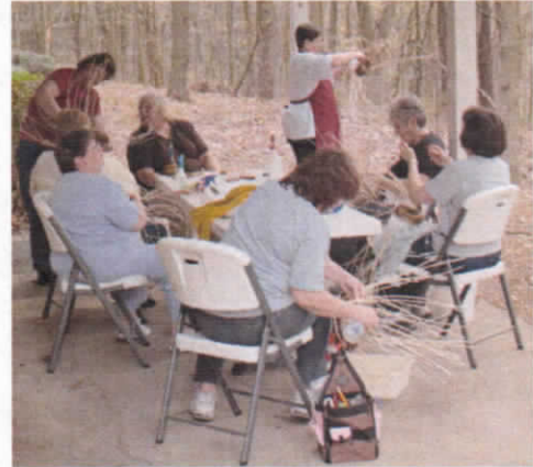
More weavers outside.

Members who attended the May guild meeting brought a basket with the base started, and went home with a special, (almost complete) basket – well, most of us did! We each wove a few rows in each other's basket resulting in a beautiful, one of a kind basket for each of us to take home.