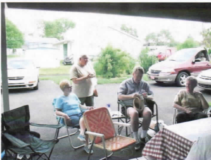
Guild members enjoying weaving and visiting during the Dye party!