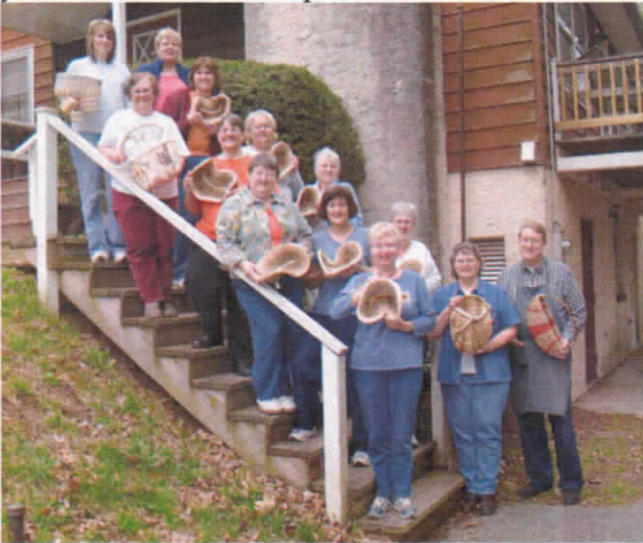
The gang at the Retreat, 2008